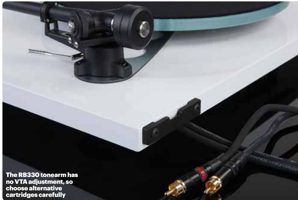
The RB330 tonearm has no VTA adjustment, so choose alternative cartridges carefully

the stiffer plinth, the Planar 3 is considerably more inert than any previous version, which should audibly reduce distortion.